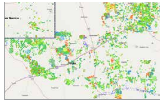
Use Enerdeq land and lease data to map Fee leases by lessee