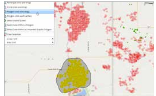
Define an area of interest, view well coverage and select items to run decline curve and economic analysis in IHS PowerTools