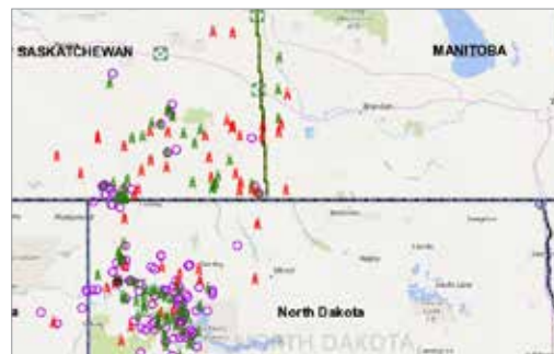
Use Activity Search to find this month's permits or where rigs are currently drilling