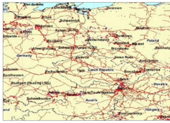
Gas Storage - Central Eastern Europe shown by name