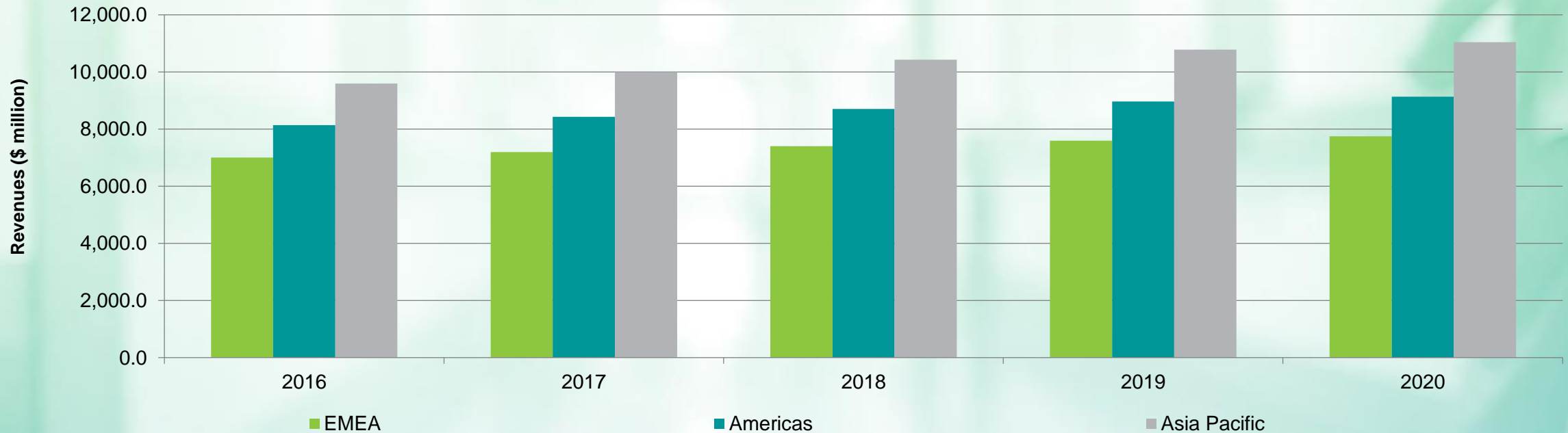
Global medical imaging market by region