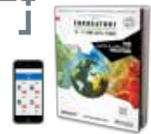
Jane's Show Daily Team

Analysis of strategic military WMD capabilities including production and policy development, and the threats posed by both nuclear proliferation and the illicit trafficking of chemical, biological, radioactive and nuclear materials.